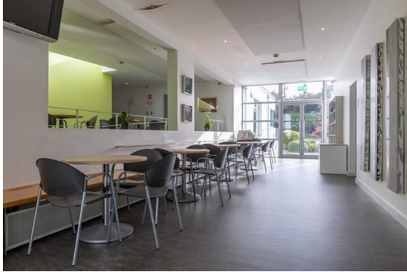
2 - Lower Reception Area

Enter through the main door at Laois Education Support Centre into the Lower Reception Area. The conference will take place in the main seminar room.