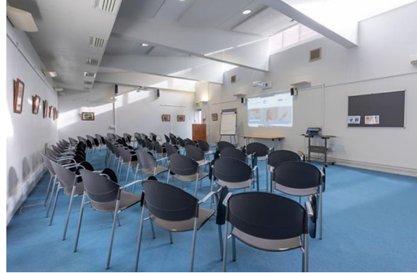
1 Main Seminar Room